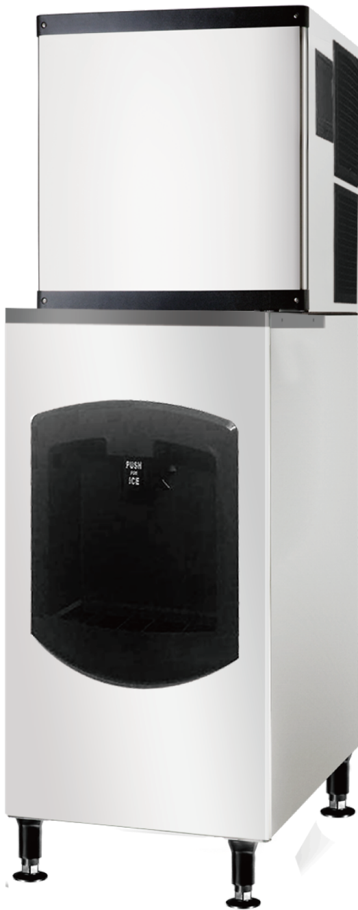
HDSICD-350 / HDSICD-420